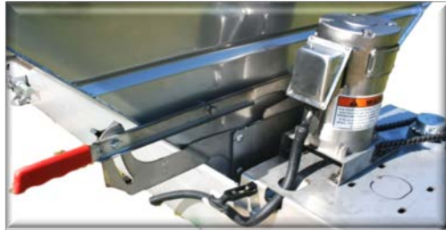
Stainless steel motor casing.

Low profile, 26" height, for better rearward visibility, in smaller trucks.