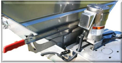
Stainless steel motor casing.

Low profile, 26" height, for better rearward visibility, in smaller trucks.