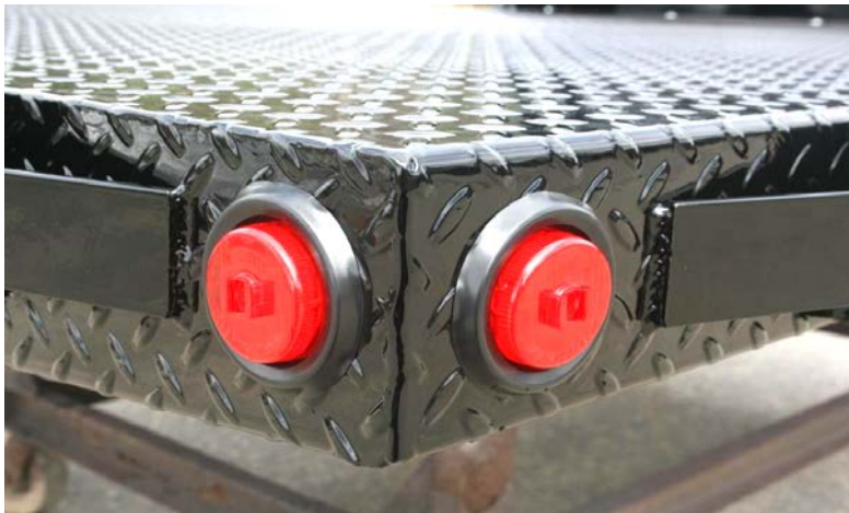
LED, PC rated, rubber mounted lighting