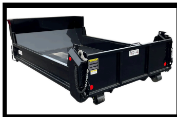
Weight: 1,800 & 2,015 lbs