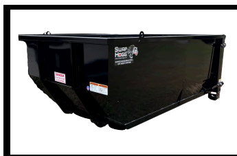
Weight: 1,850 & 2,070 lbs