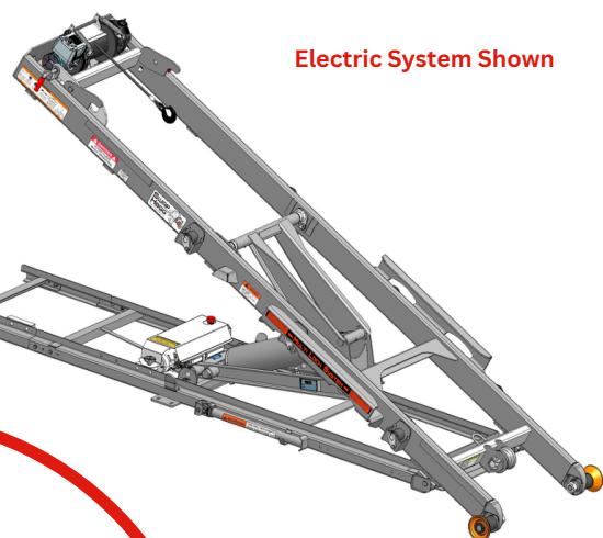
Electric System Shown