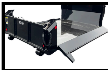
Weight: 1,900 & 2,160 lbs