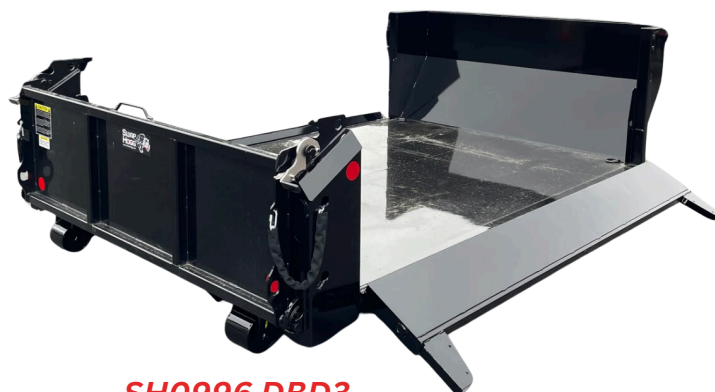
SH0996 DBD3 SH1196 DBD3