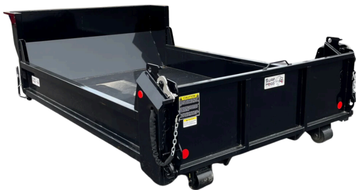
SH0996 DBD1 SH1196 DBD1